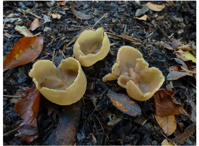
Peziza arvernensis on woodchip, the right hand collection probably having emerged after the heavy rain earlier last week and looking more typical for the species. (PC)

This being a well recorded area, in part due to the fact that I cut my mycological teeth here and in nearby Hodgemoor Woods, living only a few minutes away for many years, we added only a couple of species new to the over-all site list. A quite unusual bracket was collected from fallen conifer wood, this was Ischnoderma benzoinum (Benzoin bracket – so named after its smell). Its slightly furry surface and softish rubbery feel are also field clues to its identity.