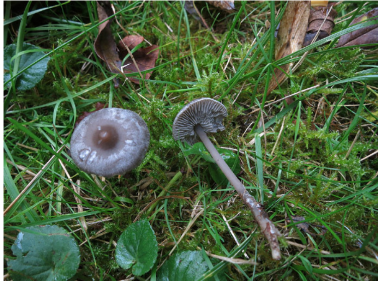
Tephroclybe rancida on the Vicarage lawn