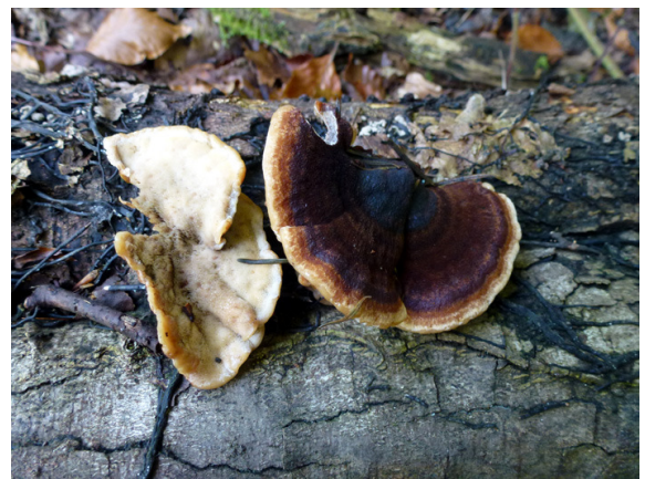
Right Ischnoderma benzoinum found on a conifer log (PC)

This being a well recorded area, in part due to the fact that I cut my mycological teeth here and in nearby Hodgemoor Woods, living only a few minutes away for many years, we added only a couple of species new to the over-all site list. A quite unusual bracket was collected from fallen conifer wood, this was Ischnoderma benzoinum (Benzoin bracket – so named after its smell). Its slightly furry surface and softish rubbery feel are also field clues to its identity.