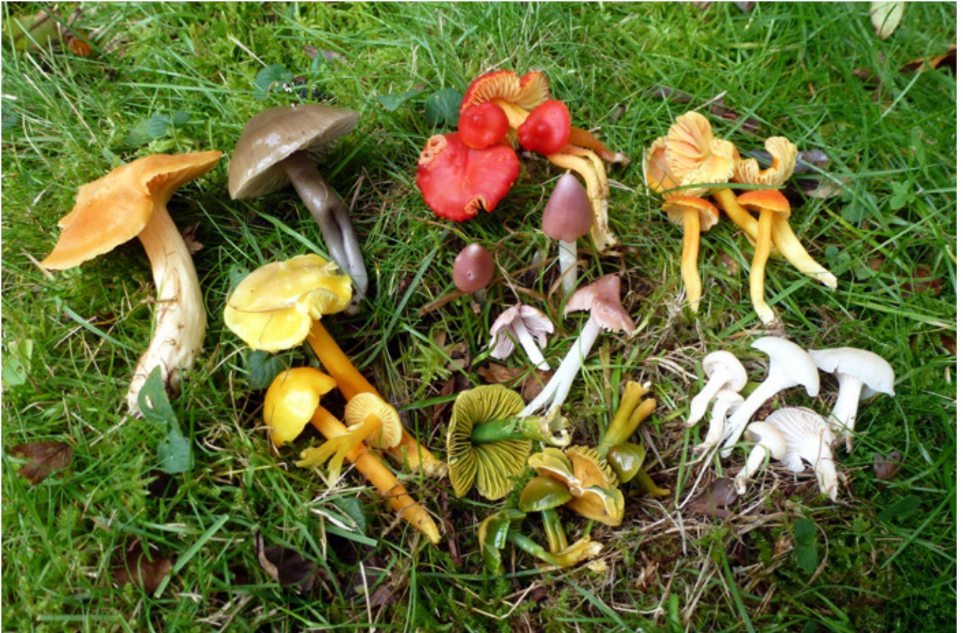
A feast for the eyes: above a collection of the eight species of waxcap we found today at Penn. Back row from left to right: Hygrocybe pratensis, H. irrigata, H. coccinea, H. reidii ; in the centre and pride of place: H. calyptriformis ; front row left to right: H. chlorophana, H. psittacina, H. virginea. Below the superb specimens of Hygrocybe coccinea found in long grass near the cricket pitch.

Many thanks to all who attended. It was disappointing that there wasn't more support (from both members of the group and the public) but they missed a treat which we much enjoyed – over 100 species in all. See also the complete list of species for the site for more information.