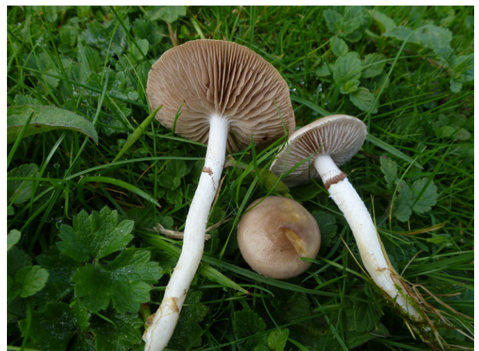
Stropharia inuncta in the grass in the Penn Churchyard (PC)

More grassland species turned up here, and we added both H. pratensis (Meadow waxcap) and the very sticky Hygrocybe irrigata (Slimy waxcap) to the waxcap collection. Just at the end some good specimens of Stropharia inuncta (Smoky roundhead) were found with their distinctive rings on the stem showing nicely.