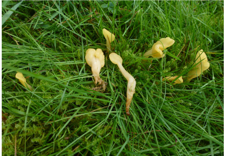
Spathularia flavida in Penn Churchyard today

as near threatened on the national red data list. Occurrence seems to be on the increase in the south with more records now, but it disappeared from the woodland part of this site in 2004, so I was delighted to discover it not far away in the churchyard the following year and we found it again here in 2010. It made me very happy, therefore, that it's obviously still thriving here. This site is unusual in the predominantly calcareous Chiltern area in that the soil is quite acidic and this could account for the fact that several species known to thrive in Scottish conifer areas have been recorded here.