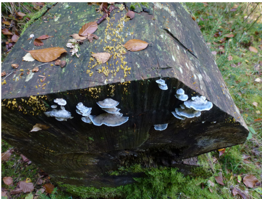
Postia caesia and Calocera pallidospathulata together on a log (PC)

We also came across a beautiful collection of fruitbodies of Postia caesia (aptly named Conifer blueing bracket) on the sawn end of a conifer trunk. On the flat surface just above were a swarm of the tiny jellylike fingers of Calocera pallidospathulata (Pale stagshorn) –it's so often the way that if conditions are ripe for one species to be fruiting well on wood there'll be something else competing with it nearby. (Don't be confused by the beech leaves visible in the photo – they were incidental and this was definitely conifer!)